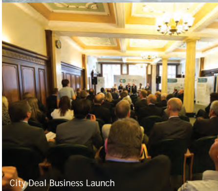
City Deal Business Launch

The Preston, South Ribble and Lancashire City Deal is gathering momentum following its official launch this summer.