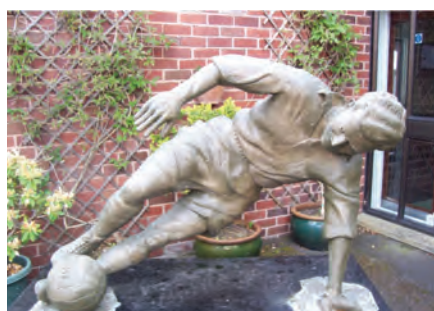
Splash sculpture at Sir Tom Finney School

Bamber Bridge contractor, Conlon Construction, has been awarded a £5m project to revamp a former college into a new campus for Sir Tom Finney Community School.