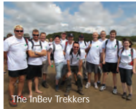
The InBev Trekkers

You are welcome to turn up on the night, otherwise please RSVP to emmat@writeanglepr.co.uk .