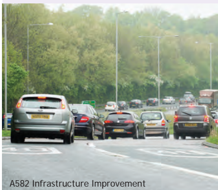
A582 Infrastructure Improvement